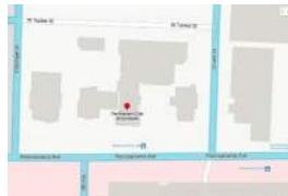
Woman's Club of Fort Worth

Please remember that members and guests not canceling dinner reservations before Tuesday noon prior to the meeting shall be responsible for dinner cost. This is necessary because costs are incurred based on the anticipated attendance (food, venue, supplies).